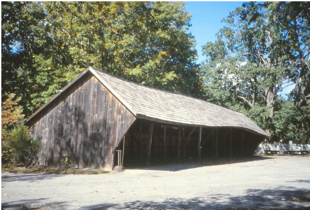
Caroline Church Carriage Shed c. 1980

The first matching grant from the RDL Gardiner Foundation was used in 2017 to stabilize the building. The roof project will commence as soon as possible. The Caroline Church of Brookhaven was established in 1723, and the church building erected in 1729. The congregation will celebrate its 296 th anniversary in 2019.