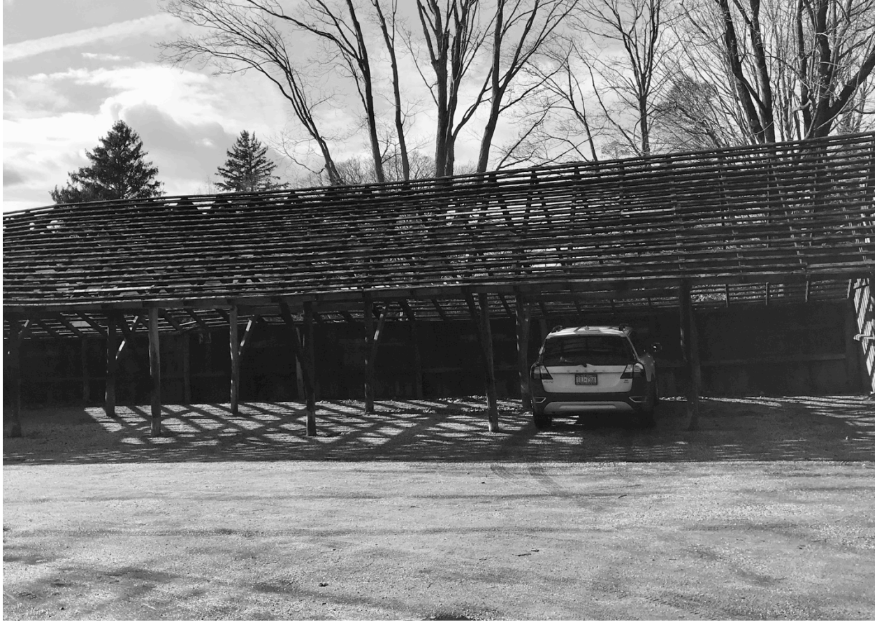
Caroline Church Carriage Shed, post stabilization, needing a roof.