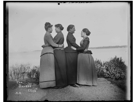
The Darned Club, October 29, 1891. Donated to the Historic Richmond Town in 1945, the original glass plate negative and image of this iconic photo, taken on the lawn of Clear Comfort, is one of the many items returning home 80 years later.